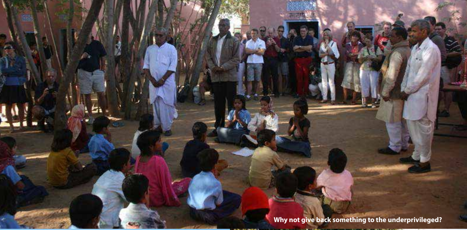
Why not give back something to the underprivileged?