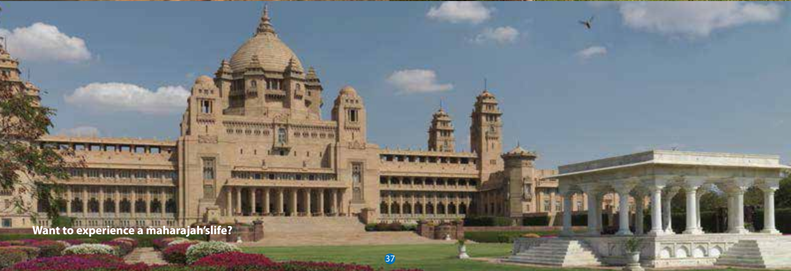
Want to experience a maharajah's life?