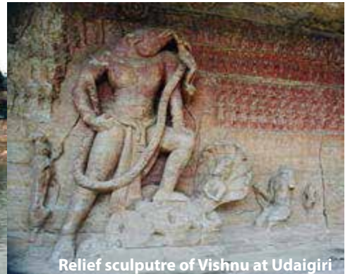
Relief sculpture of Vishnu at Udaigiri