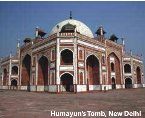
Humayun's Tomb, New Delhi

A wonderful introduction to India, this tour incorporates the different facets of the country, from the political grandeur of Delhi to the artistic perfection of the Taj Mahal and finally to the regal palaces and fortresses of the Rajput maharajas. Taken together, the tour provides visitors a fascinating insight into the mysteries of India.