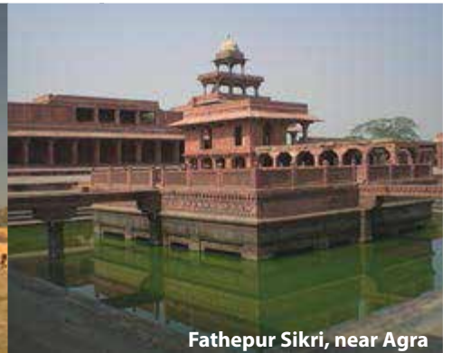
Fatehpur Sikri, near Agra