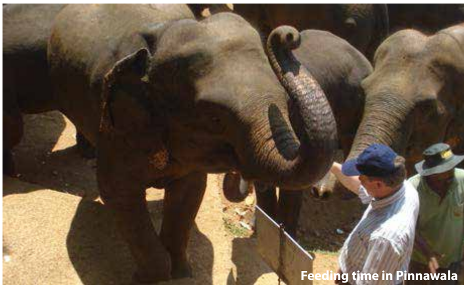
Feeding time in Pinnawala