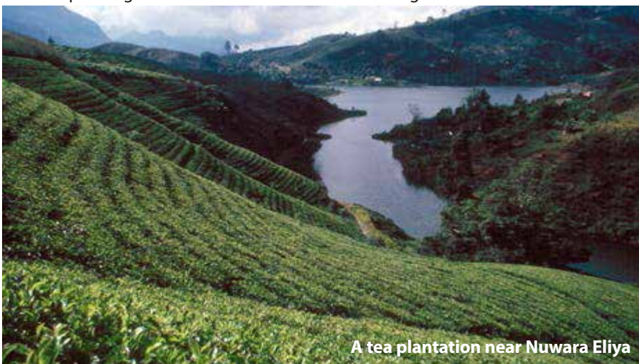
A tea plantation near Nuwara Eliya

Sigiriya is an ancient rock fortress and palace ruin in the central Matale District of Sri Lanka, surrounded by the remains of an extensive network of gardens, reservoirs, and other structures. A popular tourist destination, Sigiriya is also renowned for its ancient paintings and is one of the seven World Heritage Sites of Sri Lanka.