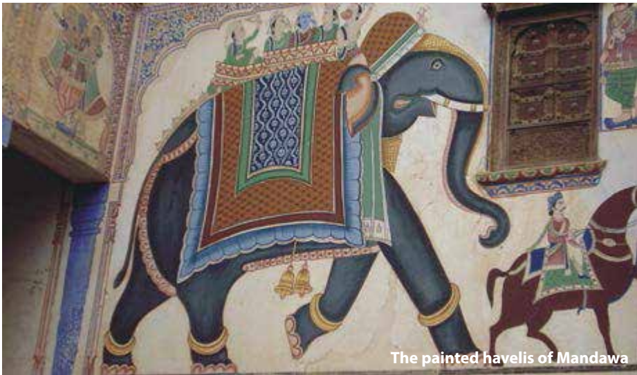
The painted havelis of Mandawa