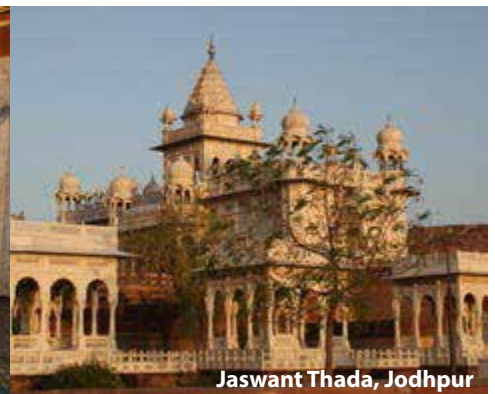
Jaswant Thada, Jodhpur