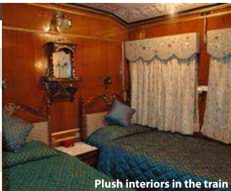
Plush interiors in the train