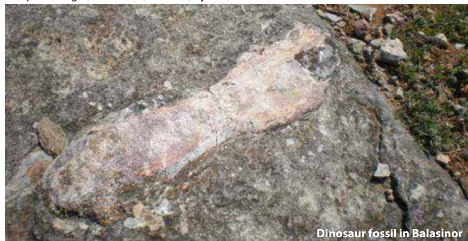
Dinosaur fossil in Balasinor

Ranthambore National Park, one of the largest national parks in northern India, is one of the best places in India to see the majestic tiger in the wild. The park lies at the edge of a plateau and is named after the historic Ranthambore fortress, which lies within the national park. Other major wild animals that can be seen here include leopard, nilgai, wild boar, sambar, hyena, sloth bear and chital.