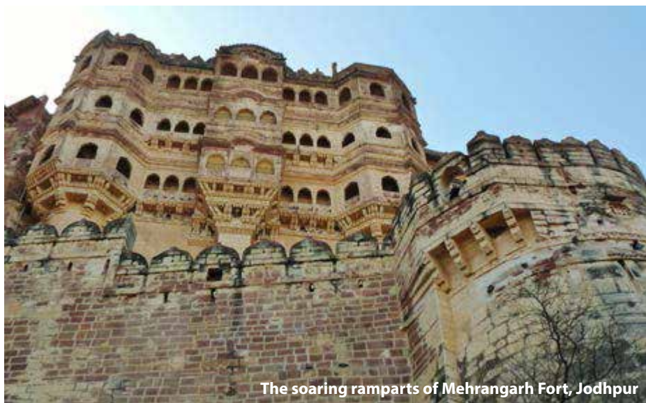
The soaring ramparts of Mehrangarh Fort, Jodhpur