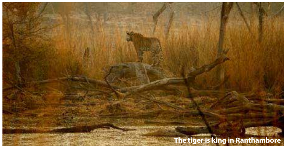
The tiger is king in Ranthambore

The foundation of the Mehrangarh Fort in Jodhpur was laid in the 15th century. Today, it houses brilliantly crafted and decorated palaces of which the most notable are Moti Mahal (Pearl Palace), Phool Mahal (Flower Palace) and Sheesh Mahal (Mirror Palace) among others.