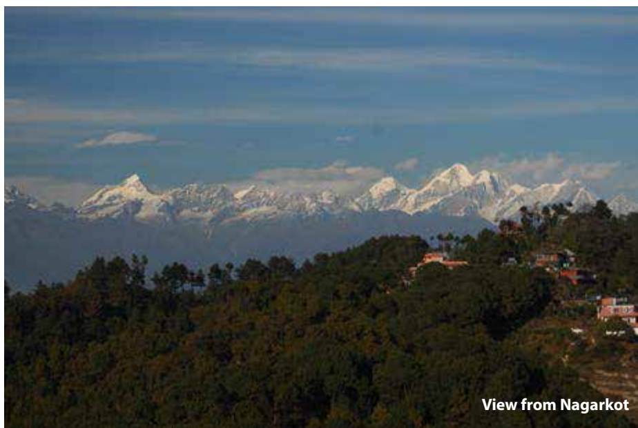
View from Nagarkot