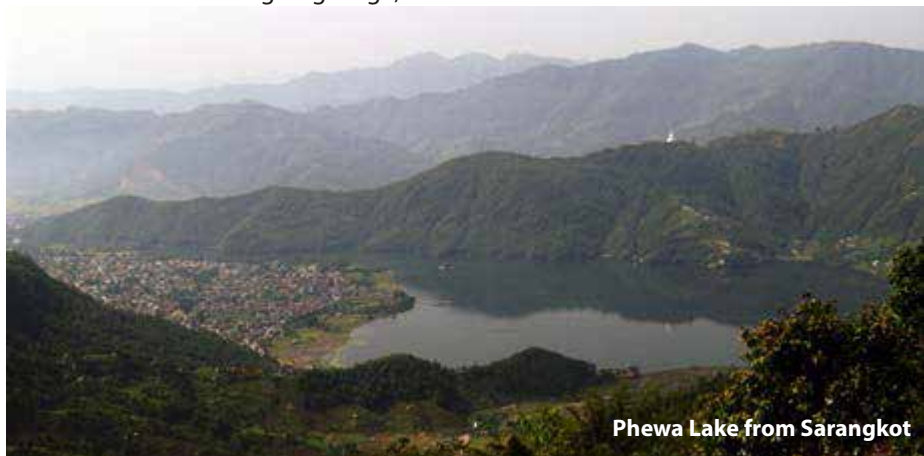
Phewa Lake from Sarangkot

Nagarkot is renowned for its sunrise view of the Himalaya including Mount Everest as well as other snow-capped peaks of the Himalayan range of eastern Nepal. You get views of the whole Langtang range, sunrise on the mountains and sunset views.