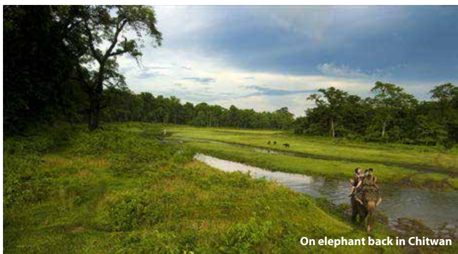
On elephant back in Chitwan

Phewa Lake is the second largest lake in Nepal and lying at an altitude of 784 m (2,572 ft). Annapurna looms in the distance from the lake and the lake is famous for the reflection of Mount Machapuchare on its surface. The holy Barahi mandir (temple) is situated on the island located in between in the lake.